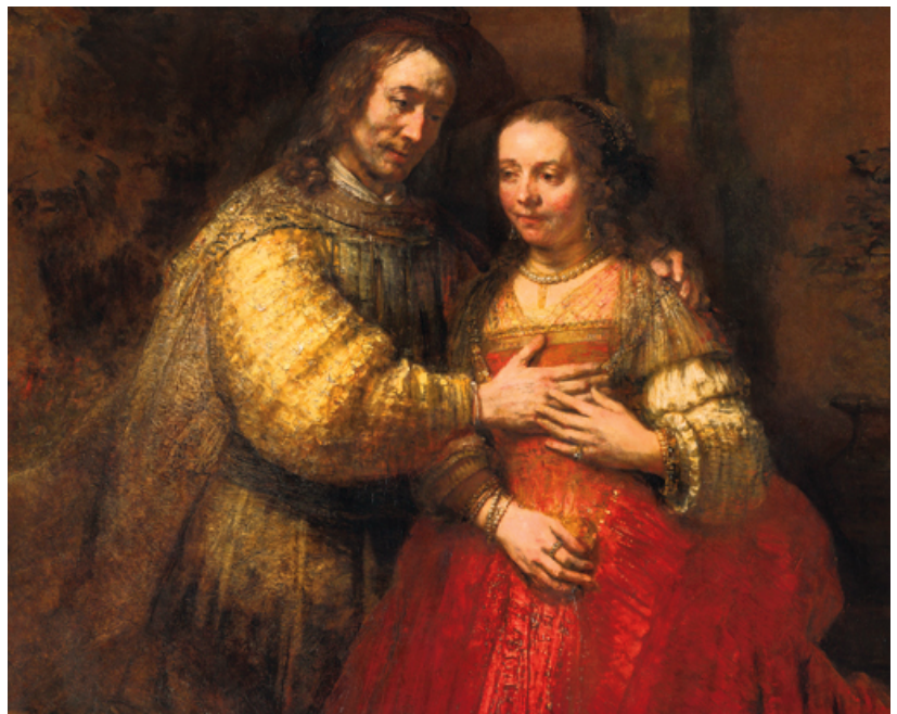
The Jewish Bride, Rembrandt, (Rijksmuseum Amsterdam)

Although there is nothing new in this, the internet delivers words and images that penetrate our daily lives far more profoundly than ever in the past, and sometimes with devastating effects.